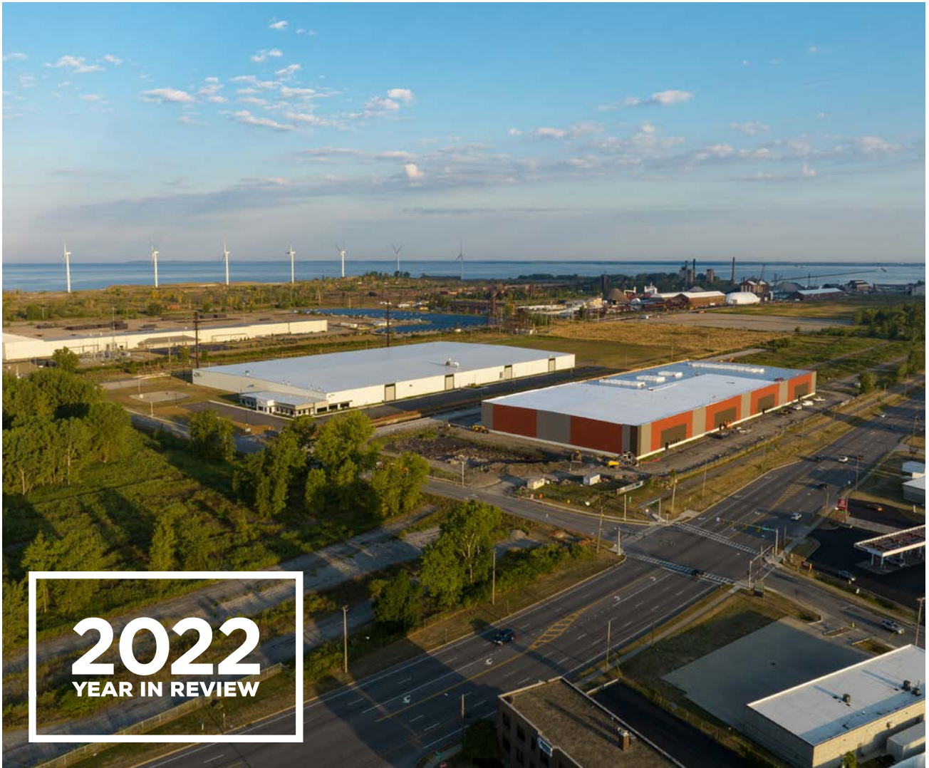
Renaissance Commerce Park - Lackawanna, NY