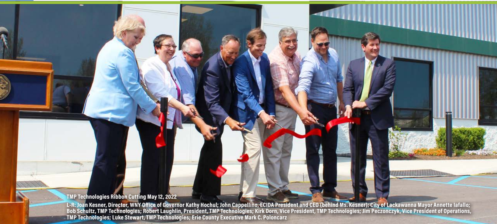
TMP Technologies Ribbon Cutting May 12, 2022